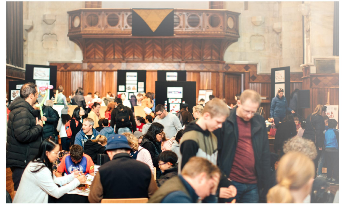
Crowds fill The Great Hall in the afternoon and every seat is occupied!

stations and in display cabinets. The Hall was busy all day, and indeed the main feedback on our exit survey – apart from enjoyment of the day itself – was a request for us to move to a larger space next time. We agree that we have probably outgrown this beautiful space, and we will with regret look for a larger venue for our next Christchurch Maths Craft Day.