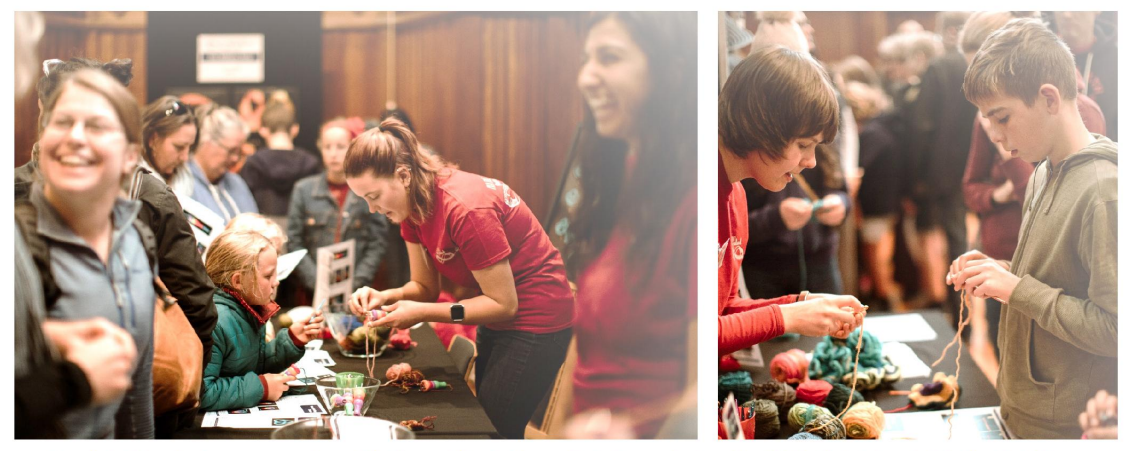
Our helpful volunteers engaging with the public at the craft stations during the 2021 Christchurch Maths Craft Day.

Maths Craft New Zealand's third Christchurch Maths Craft Day was held on Sunday 23<sup>rd</sup> May in The Great Hall and The Teece Museum of Classical Antiquities, both located in Christchurch's historic Arts Centre. Over 1,500 visitors explored maths through crafts at our free day-long event. They enjoyed eight craft creation stations in The Great Hall and one in The Teece Museum, along with public lectures given by mathematicians, crafters, and classicists. Our hands-on craft stations were staffed by a trained team of volunteers drawn from University of Canterbury students and staff, from local school teachers, and from a growing pool of experienced volunteers from other Maths Craft New Zealand events. These volunteers guided our visitors through the maths and the craft at the craft stations: Möbius strips, mathematical colouring and drawing, knitted knots, Menger cubes, origami, flexagons, crocheted hyperbolic planes, meanders, and string art.